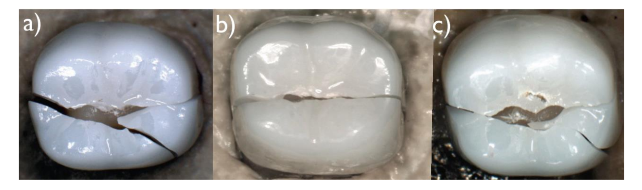
Figure 4: Y-TZP bulk fracture after single load to failure test after mouth-motion fatigue; a) Super Speed, b) Speed, c) Long-term sintered.

Final Report: Sinter Time Effect on Full Anatomic Y-TZP crowns