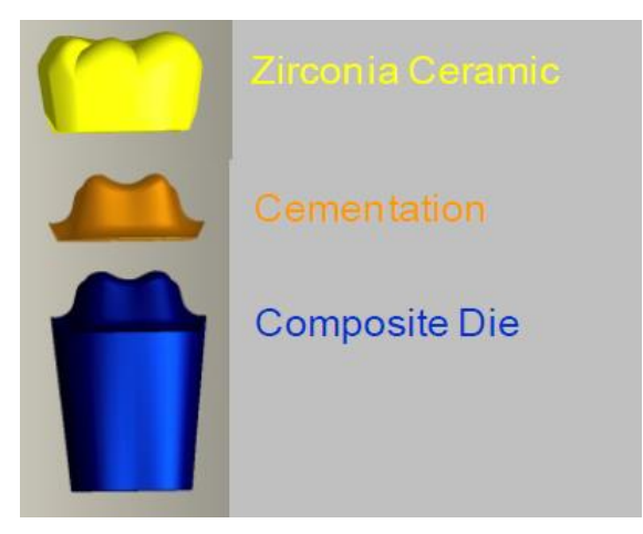
Figure 1: Crown specimen structure

Crown/ Sample preparation: Monolithic full anatomic Y-TZP crown specimens were cemented to dentin-like based composite dies.