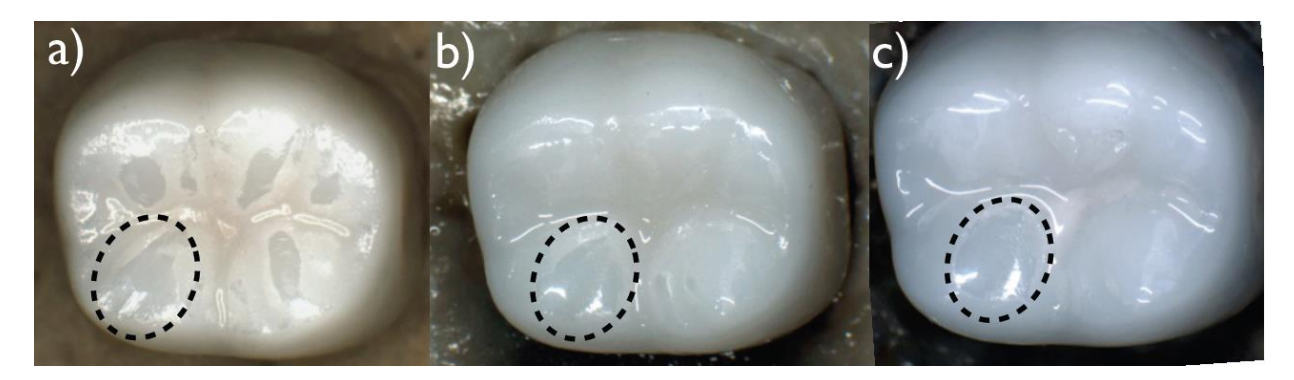
Figure 3: Monolithic Y-TZP crowns after fatigue, circle indicates load application area a) Super Speed, b) Speed, c) Long-term sintered.

All tested monolithic Y-TZP crowns showed no bulk or cohesive fracture failures during and after mouthmotion fatigue. The 5-year simulated survival rate of monolithic Y-TZP crowns at 200 N was 100%. Only superficial wear of the glazing material was observed. The glossy surface of the Y-TZP ceramic in the area where the 200 N sliding load was applied over 1.2 mio cycles, is depicted in Figure 3.